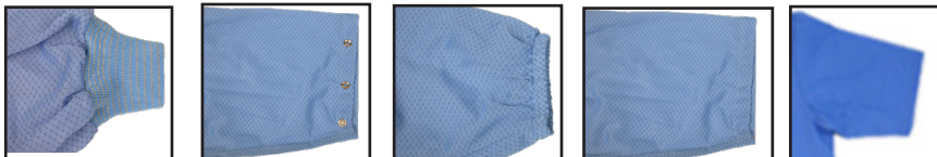
2" Knitted Elastic Cuff

Special manufactured items are not returnable for credit.