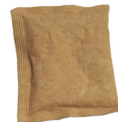
Desiccant in Kraft Pouch