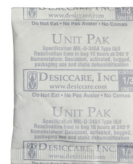
Desiccant in Tyvek® Pouch