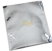
Dri-Shield™ 2700 Series High Puncture Aluminized Moisture Barrier