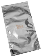
Dri-Shield™ 3000 Series High Barrier Nylon & Foil Moisture Barrier