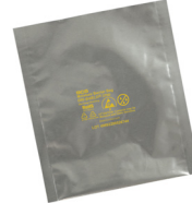
Dri-Shield® 3700 Series High Puncture, High Barrier Foil Moisture Barrier