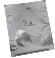
1500 Series Metal-Out Static Shielding Bag Required by some hi-tech companies