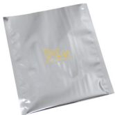
Dri-Shield® 2000 Series Aluminized Moisture Barrier