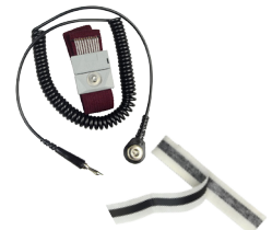
2214 Adjustable 2209 Disposable