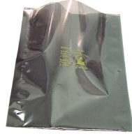
1300 Series Metal-In Static Shielding Bag High Puncture Resistance