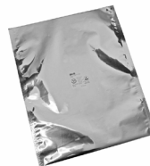
3370 Series Cleanliness Tested Aluminized Moisture Barrier