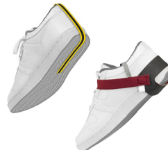
5402 Disposable 2051 Hook and Loop