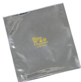
Dri-Shield® 2700 Series High Puncture Aluminized Moisture Barrier