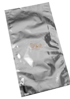
Dri-Shield™ 3400 Series High Barrier Foil Moisture Barrier