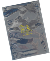
1000 Series Metal-In Static Shielding Bag Greatest Number of Stock Sizes