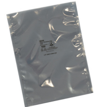
1500 Series Metal-Out Static Shielding Bag Required by some hi-tech companies