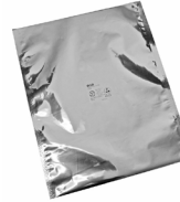
3370 Series Cleanliness Tested Aluminized Moisture Barrier