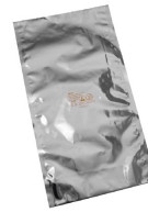
Dri-Shield™ 3700 Series High Puncture, High Barrier Foil Moisture Barrier