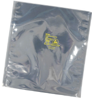
1000 Series Metal-In Static Shielding Bag Greatest Number of Stock Sizes