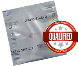
81705 Series Bags & Film Qualified to MIL-PRF-81705E Type III, Class 2