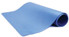
Mat Roll TM24600L3BL