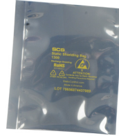
1300 Series Metal-In Static Shielding Bag High Puncture Resistance