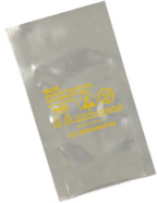
Dri-Shield® 3000 Series High Barrier Nylon & Foil Moisture Barrier