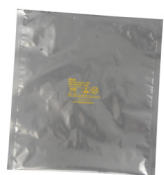
Dri-Shield® 3400 Series High Barrier Foil Moisture Barrier