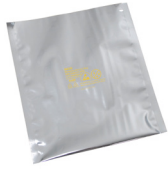
Dri-Shield™ 2000 Series Aluminized Moisture Barrier