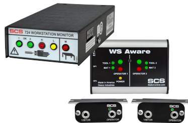
724, WS Aware