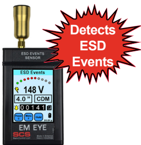
EM Eye - ESD Event Meter