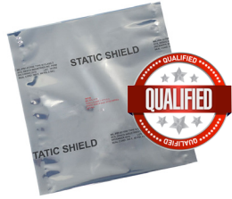
Qualified to MIL-PRF-81705E Type III, Class 2