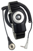
Single or Dual, 5', 6', 12' Fabric, Metal, Disposable