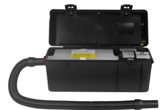
Electronic Service Vacuum