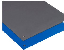
Rubber (soldering), Vinyl Dual or Three Layer all widths, Up to 50'