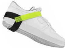
Standard, Cup, Heels, Disposable