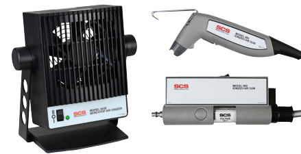
Benchtop, Overhead, Air Gun