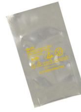
Foil-High Barrier, Aluminum-Low Barrier