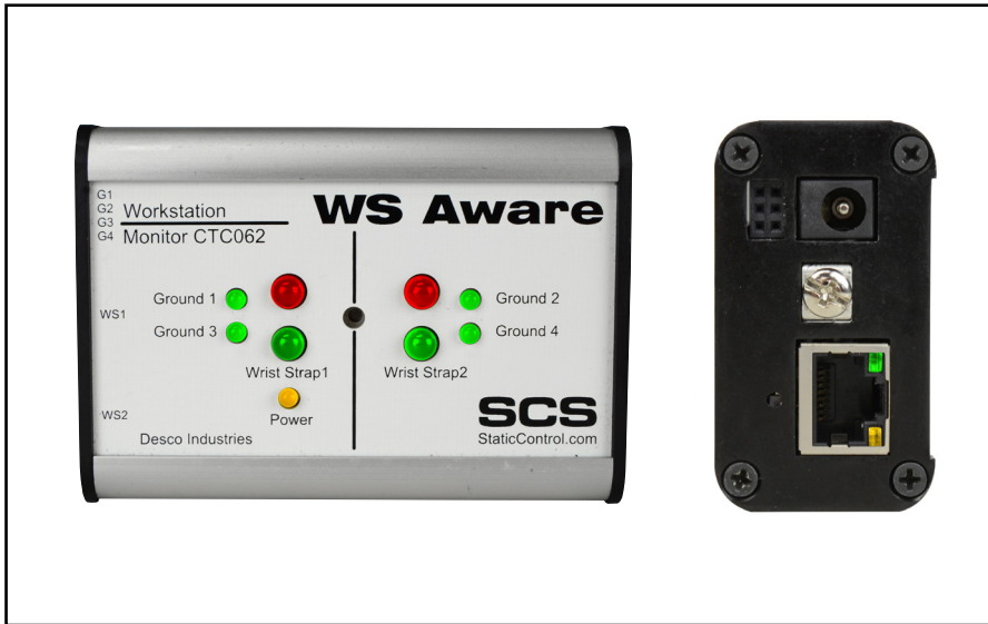
CTC062 WS Aware Monitor