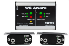
WS Aware Dual Wire Monitor Ensures ongoing monitoring of two operators and two worksurfaces for ESD Compliance with software compatibility