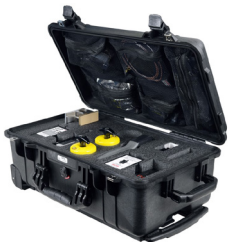
EOS/ESD Assessment Kit Use to measure, verify and qualify products for use in the ESD Protected Area