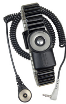
MagSnap 360°™ Metal Wrist Strap Kit 360° Rotation Between Wristband and Coil Cord