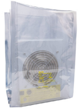
Gusset Bags Protects ESD sensitive contents from electrostatic fields and electrostatic discharges