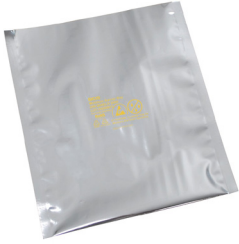
Dri-Shield® 2000 Series Designed for moisture and electrostatic discharge (ESD) sensitive items (such as SMT)