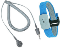
Adjustable Wrist Strap Fits most sizes to provide reliable protection