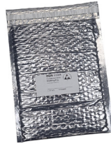
2300R Series Cushioned Tape Top Bag Metallized Shielding Bag with Closed Cell Air-Cushion Protection Layers