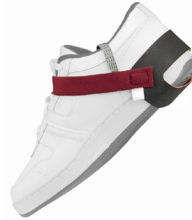
Heel Grounder with Dual Cup Used to ground standing or mobile operator to ESD Flooring