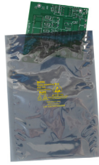
PCL100 Clean Series Static Shielding Bag ESD Safe Packaging for Cleanroom Use