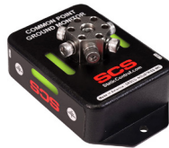
Common Point Ground Monitor Continuously monitors the path-to-ground integrity of the outlet