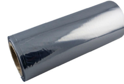
1000 Series Tubing Roll Protects ESD sensitive contents from electrostatic fields and electrostatic discharges (ESD)