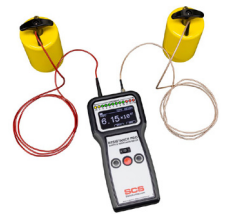
Resistance Pro Meter Kit Displays resistance mantissa and exponent, temperature, relative humidity and test voltage