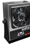
Ion Pro™ Benchtop Ionizer Steady-state DC Benchtop Ionizer with Ion Gauge™ Technology