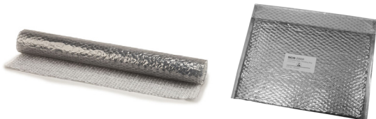
Closed cell air-cushion layer Save packing time and labor