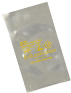
Dri-Shield® 3000 Series High Barrier Nylon & Foil Moisture Barrier