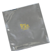
Dri-Shield® 2700 Series High Puncture Aluminized Moisture Barrier