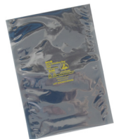
1000 Series Metal-In Static Shielding Bag Greatest Number of Stock Sizes