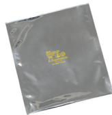
Dri-Shield® 2700 Series High Puncture Aluminized Moisture Barrier