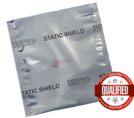
81705 Series Bags & Film Qualified to MIL-PRF-81705E Type III, Class 2