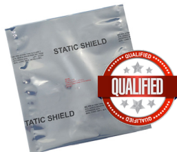
81705 Series Bags & Film Qualified to MIL-PRF-81705E Type III, Class 2