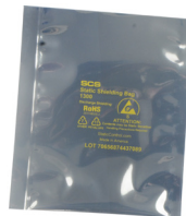
1300 Series Metal-In Static Shielding Bag High Puncture Resistance