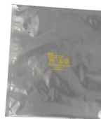
Dri-Shield® 3400 Series High Barrier Foil Moisture Barrier