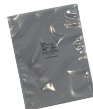
1500 Series Metal-Out Static Shielding Bag Required by some hi-tech companies