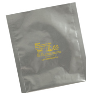
Dri-Shield® 3700 Series High Puncture, High Barrier Foil Moisture Barrier