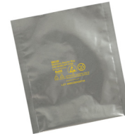
Dri-Shield® 3700 Series High Puncture, High Barrier Foil Moisture Barrier