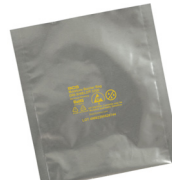
Dri-Shield® 3700 Series High Puncture, High Barrier Foil Moisture Barrier