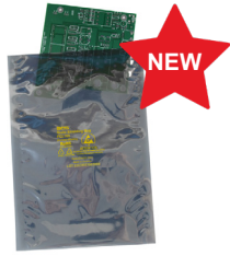
PCL100 Clean Series Metal-In Static Shielding Bag ESD Safe Packaging for Cleanroom Use