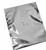
3370 Series Cleanliness Tested Aluminized Moisture Barrier