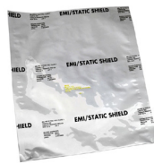
81705 Series Bags & Film Qualified to MIL-PRF-81705E Type I, Class 1