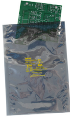
PCL100 Clean Series Metal-In Static Shielding Bag ESD Safe Packaging for Cleanroom Use