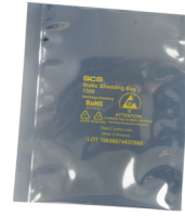
1300 Series Metal-In Static Shielding Bag High Puncture Resistance