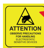
Clean ESD Attention Label

Protects ESD sensitive contents from electrostatic fields and electrostatic discharges (ESD)