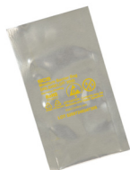
Dri-Shield® 3000 Series High Barrier Nylon & Foil Moisture Barrier