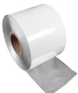
Dri-Shield® 3300 Series

White outer layer is ideal for printing company logos or product information