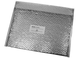
2300R Series Cushion Bags Closed cell air-cushion layer Save packing time and labor