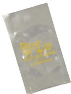
Dri-Shield® 3000 Series High Barrier Nylon & Foil Moisture Barrier