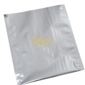
Dri-Shield® 2000 Series Aluminized Moisture Barrier